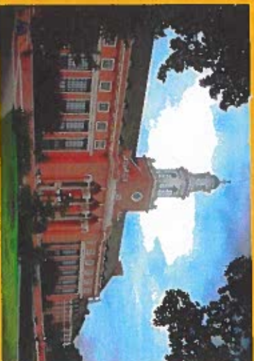
Oklahoma State University